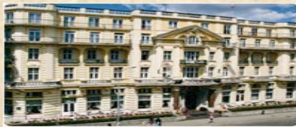
Parkhotel Schoenbrunn, Vienna, Austria.

Schoenbrunn Palace, in the interesting and varied Hietzing area, and nearby the Vienna Zoo. Visitors will have the weekend following the conference free to visit Vienna.